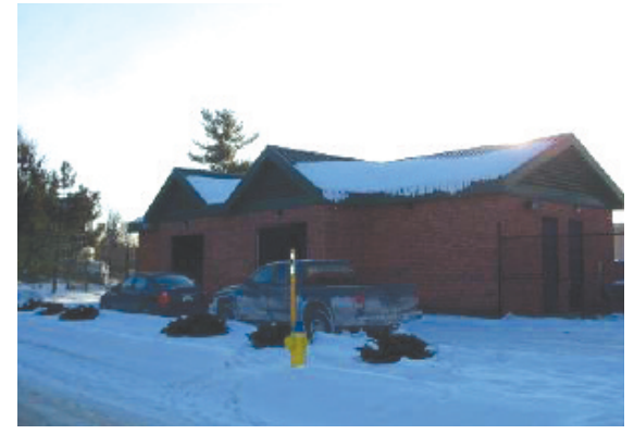
Carp pumping station

The municipal wells draw groundwater from a sand and gravel aquifer that is replenished by water that infiltrates through the Carp ridge.