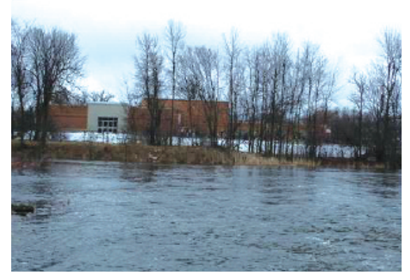
Perth Water Treatment Plant

An intake draws water from the Tay River and directs it into the water treatment plant.