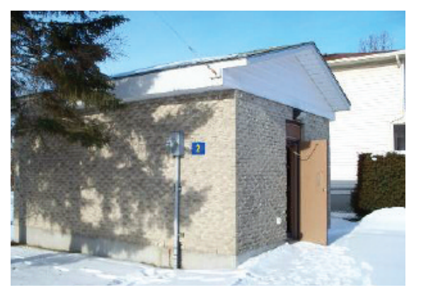
King's Park (Richmond) Well 1

The municipal wells draw groundwater from the Nepean Sandstone Aquifer which is well-known for supplying a good volume of quality drinking water.