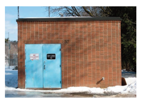
Westport pumping station

The municipal wells draw groundwater from the Nepean Sandstone Aquifer which is well-known for supplying a good volume of quality drinking water.