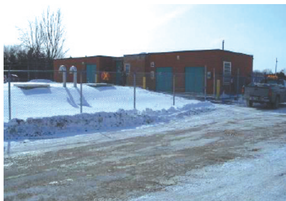
Kernahan Pumping Station (Kemptville)

The municipal wells draw groundwater from the Nepean Sandstone Aquifer which is well-known for supplying a good volume of quality drinking water.