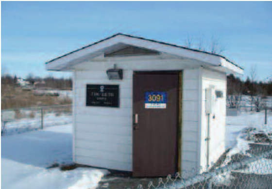
Munster Well 1

The municipal wells draw groundwater from the Nepean Sandstone Aquifer which is well-known for supplying a good volume of quality drinking water.