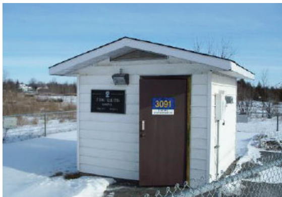
Munster Well 1

The municipal wells draw groundwater from the Nepean Sandstone Aquifer which is well-known for supplying a good volume of quality drinking water.