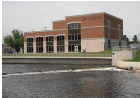
Smiths Falls Water Treatment Plant

An intake draws water from the Rideau River and directs it into the water treatment plant.