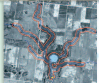
In this example, the yellow dot represents the location of the water intake. The red lines show the area of the Intake Protection Zone.